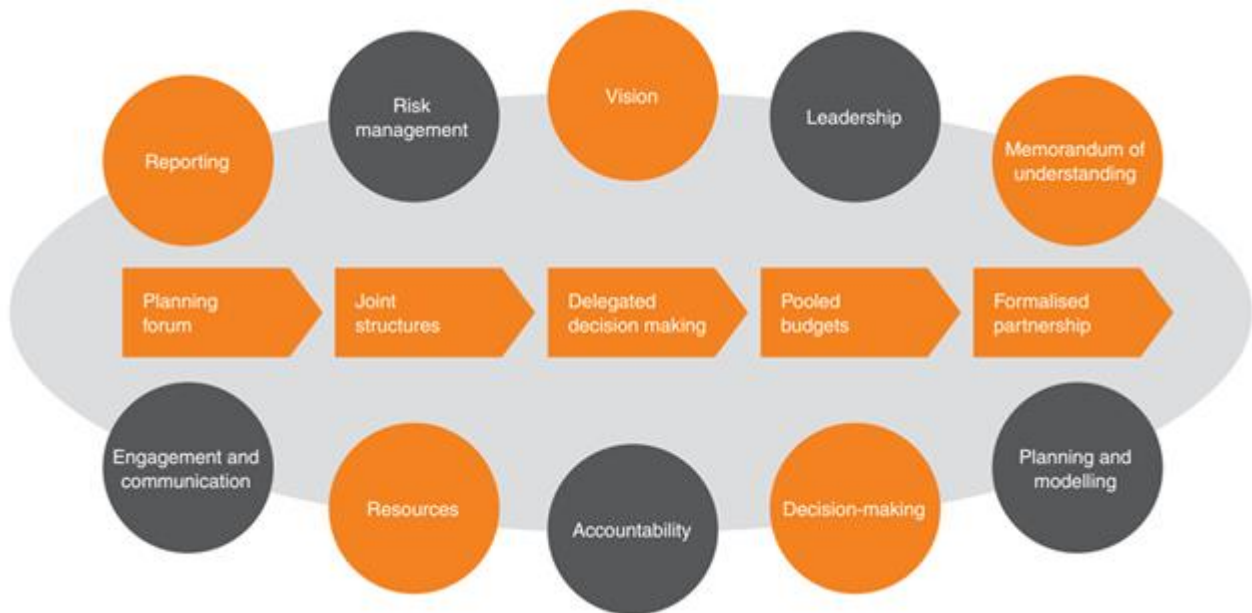
Chart 2: Governance spectrum and supporting key elements

Additionally, the HFMA corporate governance map 15 has been devised to provide links to key guidance and tools to support effective corporate governance within the NHS and includes a section specific to Scotland.