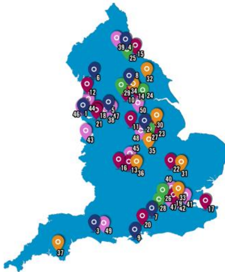
Figure 2: NHS England’s map showing the location of the vanguard sites. 4

Vanguard sites are responsible for leading the development of care models and improving the care received by people from their own organisations. The 50 vanguard sites chosen are made up of providers and commissioners across the health and social care sectors and include private, voluntary and not-for-profit organisations. Figure 2 shows the location of each vanguard site 3 .